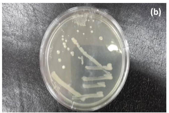
Figure 1. (a) Pseudomonas aeuroginose bacteria on nutrient agar, (b) Alcaligenes faecalis bacteriaon nutrient agar.