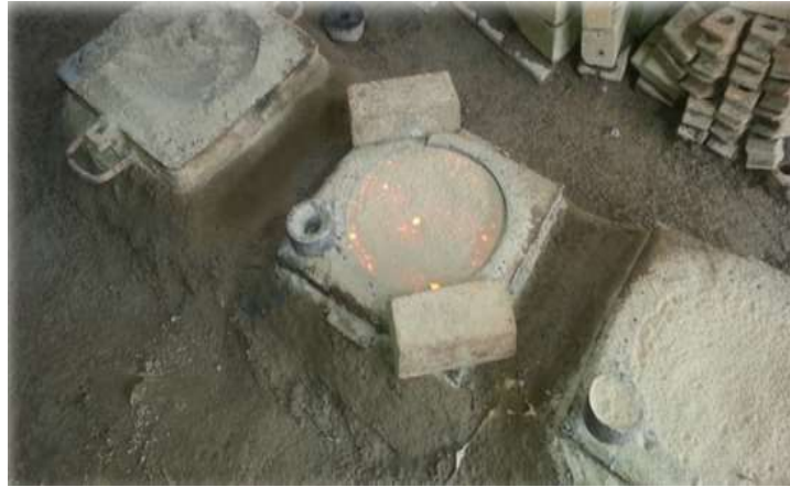
Plate (1): Foundry Sand Used in this Study.

The foundry sand is normally of a higher quality than natural sands used in fill construction sites