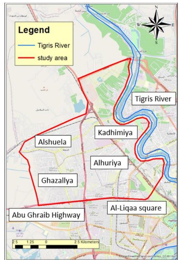
Figure 1. The Study area

The GIS program introduces a lot of benefits to researchers in building the road network and choosing the areas in which alternatives are added and drawn [23,24]. The simulation program is represented by the TransCAD program, where the traffic movements and the traffic congestion areas in the network are identified. When the new alternatives can be added to the network of the study area, the best alternative among them can be chosen through the AHP process [25], in which the criteria that separate the alternatives are selected to choose the best among them.