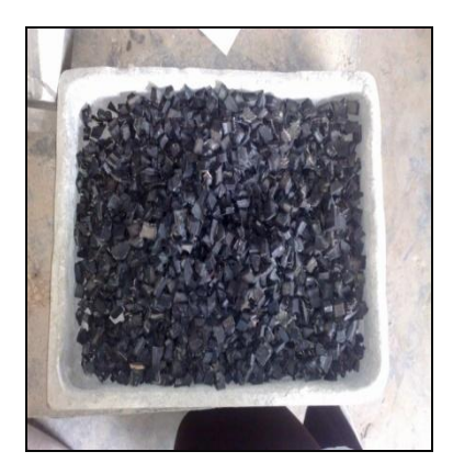
Fig.(1)Waste Tires Particles