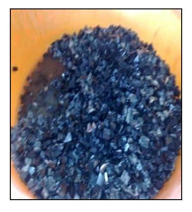
Fig.(2)Washing The Tire Fig Particles Sa